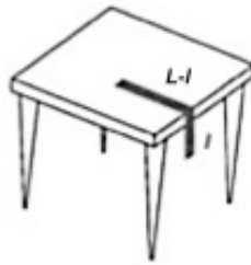
Figure 1: A rope sliding on a table

A rope of length L and linear mass density \mu is resting on a horizontal table. A segment of the